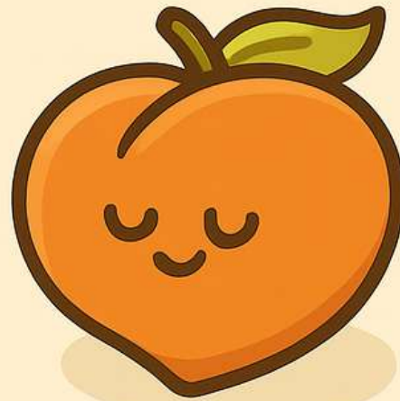
1 ripe peach (who survived May)