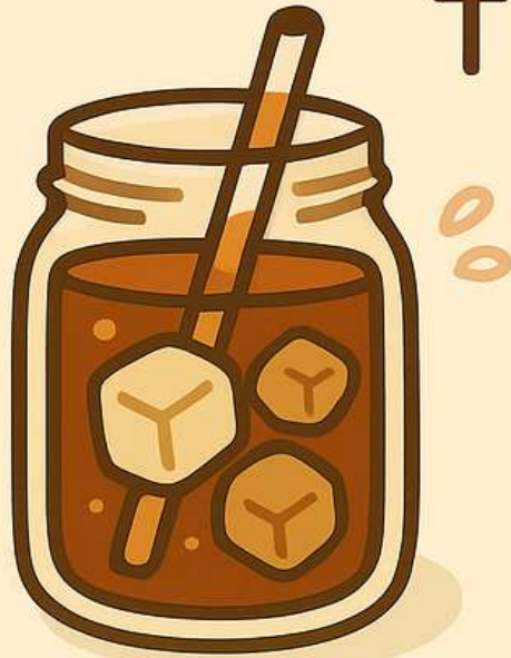
Iced tea (infused for a cooler era)