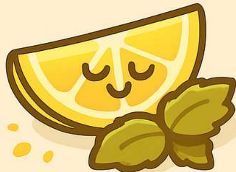
Lemon and mint (or only one of the two, your choice)