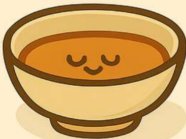
Syrup (to sweeten the tea if it's a bit too cool)